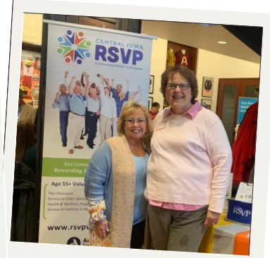
Rock On in Retirement