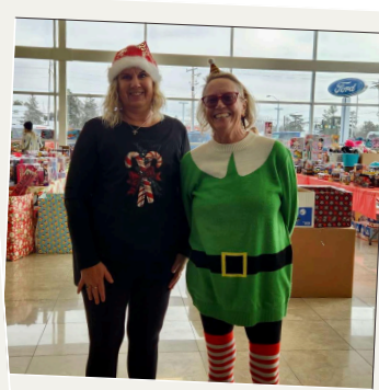
Salvation Army Toy Shop