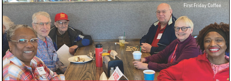
First Friday Coffee