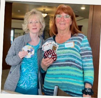
Making Card Holders