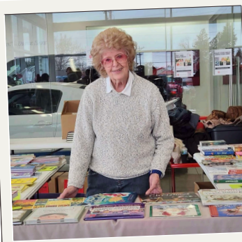
Raising Readers Event